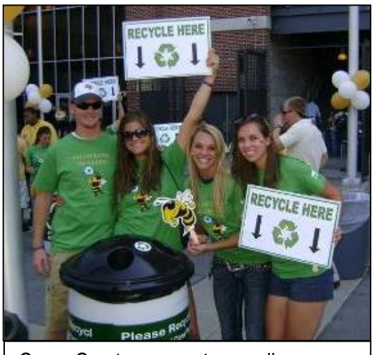
Green Greeters promote recycling outside Bobby Dodd Stadium.

At each home football game we will be searching for a "Green Tailgater of the Game" who will be featured on the stadium video board. Use the Georgia Tech <u>Green Tailgating Guide</u> for inspiration and get noticed!