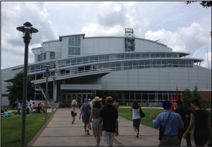
Georgia Tech's Campus Recreation Center has a rooftop solar array that, at the time of its construction, was the largest in the world.