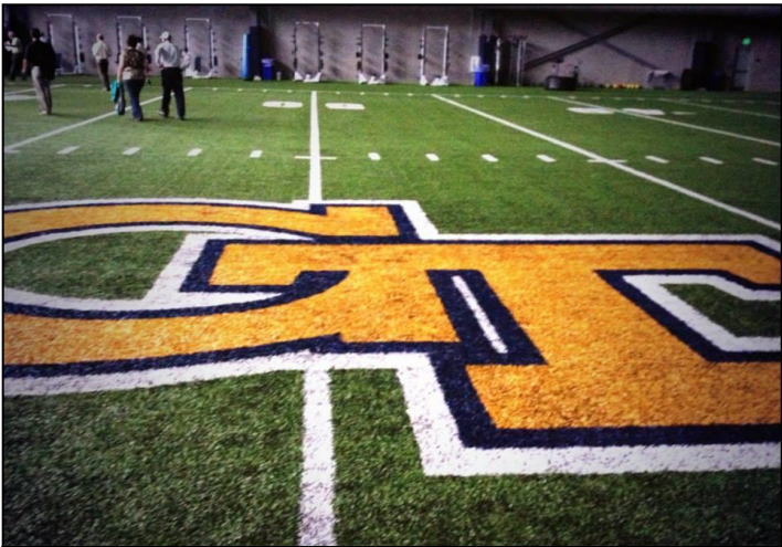
Summit participants had the opportunity to tour many of Georgia Tech's athletic and recreational facilities to learn about their sustainability features.

For more information about the Collegiate Sports Sustainability Summit, please click here .