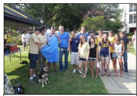
The OSWM&R would like to thank all of the fans and volunteers who participated in the Game Day Recycling program this season.

GDR would not be possible with out the help of volunteers and sponsors. The Office of Solid Waste Management & Recycling (OSWM&R) would like to take this opportunity to