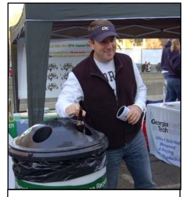
A total of 24.1 tons of bottles, cans and food waste were diverted from the landfill during the 2011 football season!

The Game Day Recycling (GDR) program recently wrapped a successful fourth season on November 26. Since 2008, Georgia Tech's Game Day Recycling program has been making home football