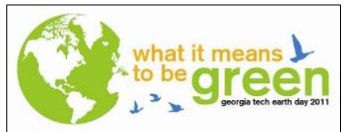
Above: The winning design for Earth Day 2011

The 2012 Georgia Tech Earth Day design contest is now open! Georgia Tech students, faculty, staff and alumni are invited to submit their designs for the 15<sup>th</sup> Annual Earth Day Celebration (which will take place on April 20, 2012). Designs should reflect the 2012 theme: <u>Helluva GREENgineer</u>.